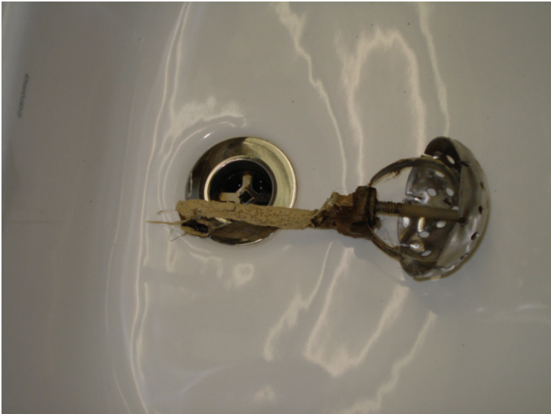
Level 28 – Urinal drain grate attachment

LEVEL 35 PHOTOS - THIS FLOOR IS IDENTICAL TO LEVEL 28 EXCEPT ENVIROFRIENDLY PRODUCT IS USED