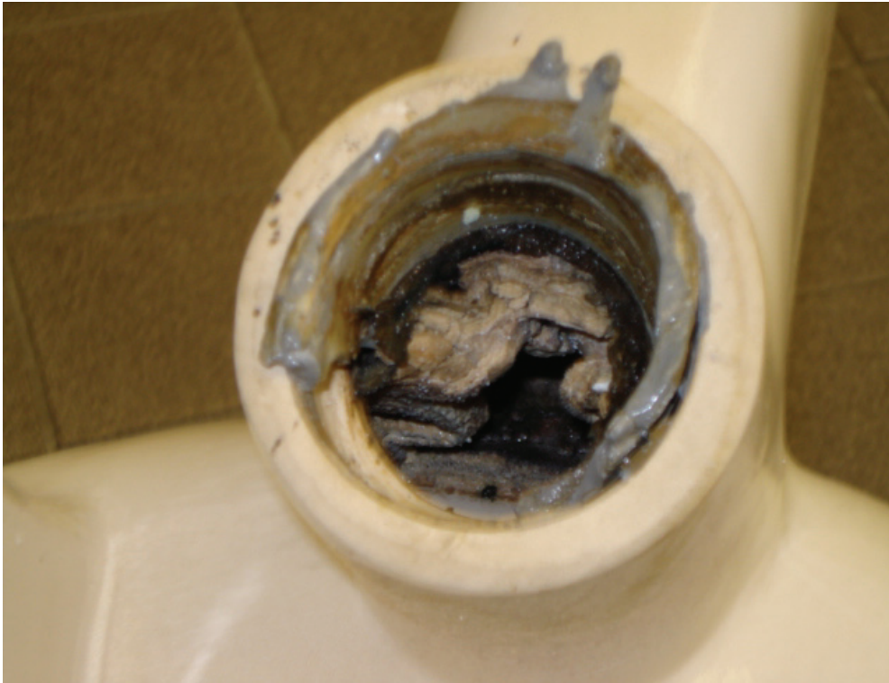
Level 28 – Rear of urinal