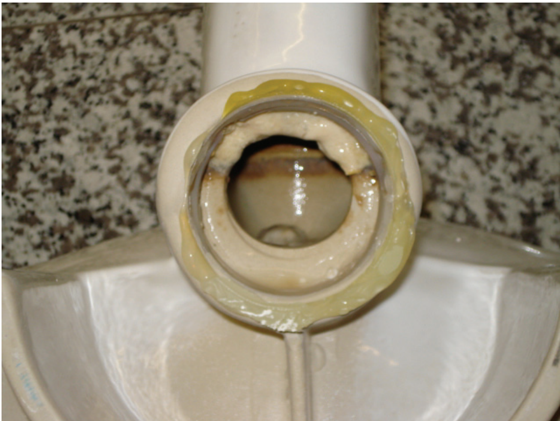
Level 35 – Rear of urinal